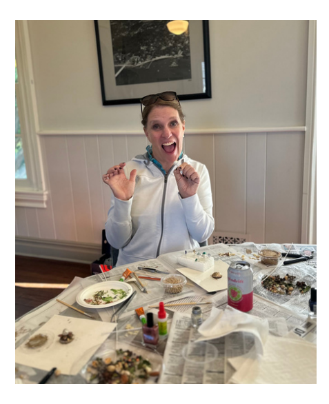
Enjoy these pictures of creative minds at work at the recent Botanical Arts workshop at Bingham Hall in anticipation of our January challenge!