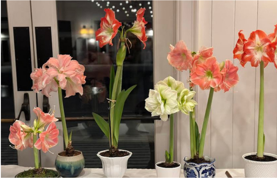
January bulbs in bloom!

An Official Publication of Rumson Garden Club