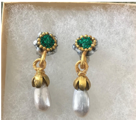
Some botanical Beauties from the January show!