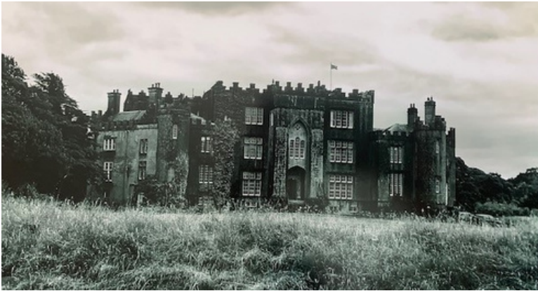
Birr Castle Demesne