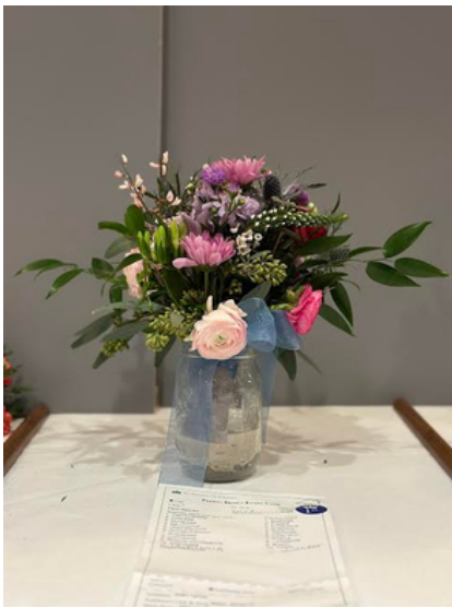
Blue Ribbon January “Tussy Mussy” Beauties!

Please RSVP to Taphy at taphy.harcsar@icloud.com