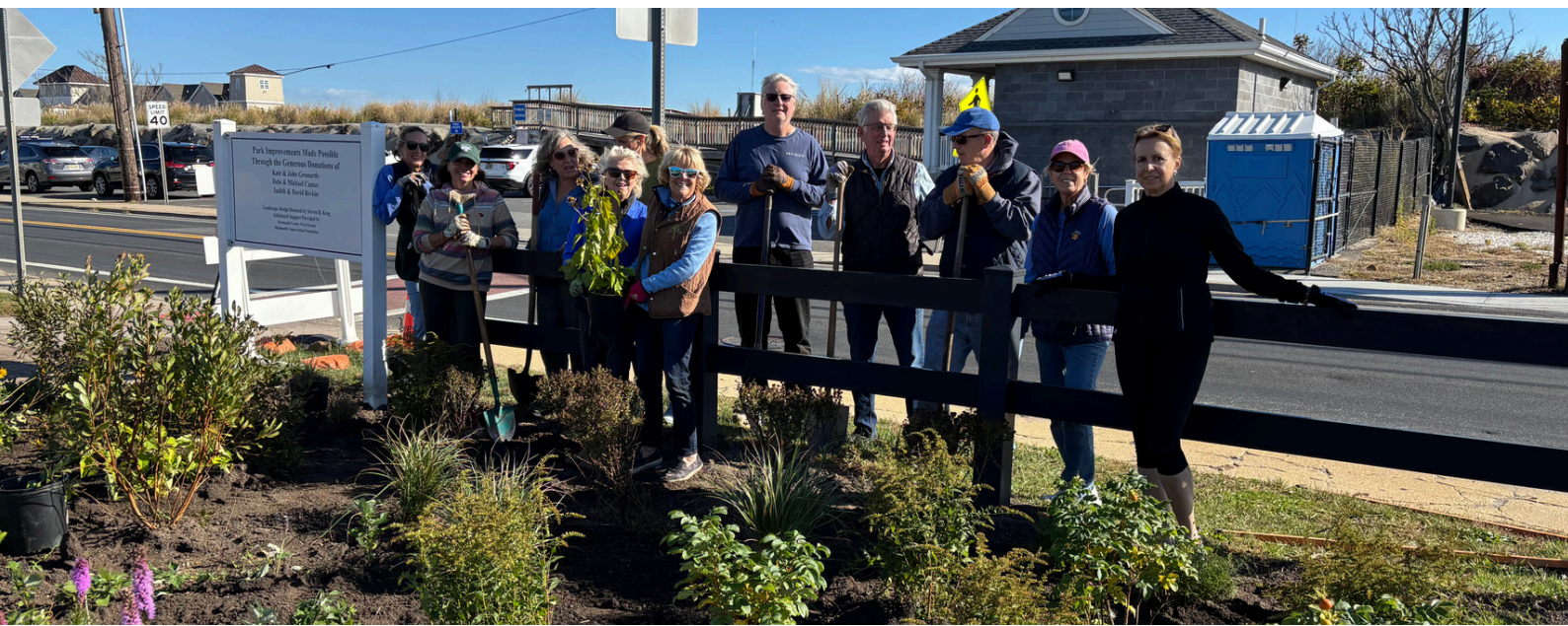
RGC ladies and friends planting Sea Bright's Shrewsbury Riverfront Park (#P4P!)

An Official Publication of Rumson Garden Club