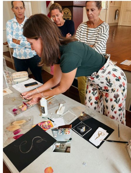
RGC ladies enjoying the October Pressed Flower Workshop